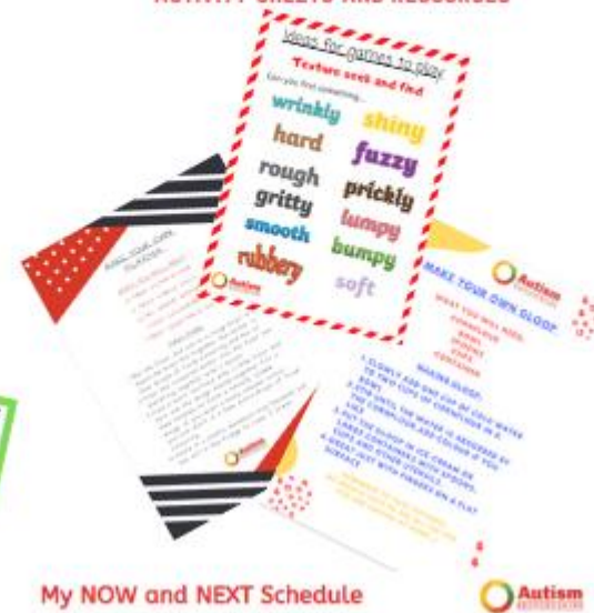
My NOW and NEXT Schedule