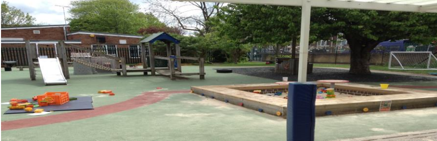
I will work outside in the garden.