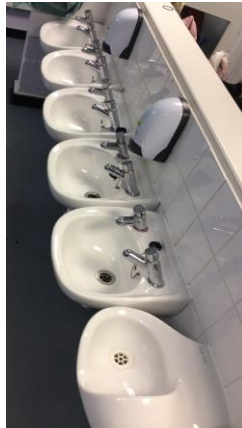
I wash my hands at the sinks.