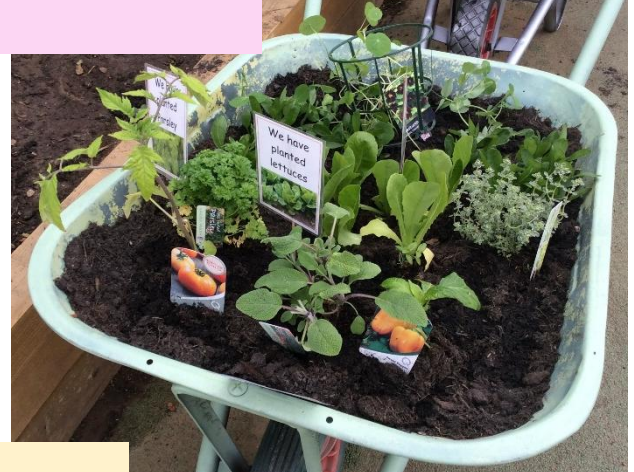
May 2025 Vs. July 2025