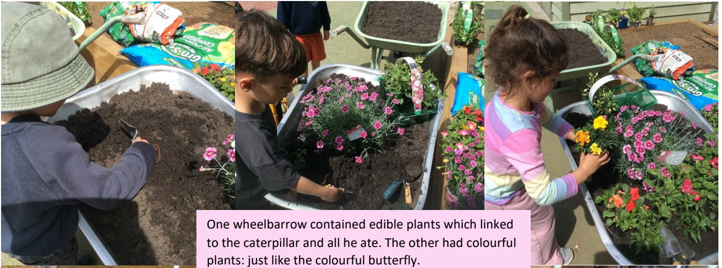
One wheelbarrow contained edible plants which linked to the caterpillar and all he ate. The other had colourful plants: just like the colourful butterfly.

In the wheelbarrows we have planted: Sweet Peppers, Tomatoes, Strawberries, Sage, Thyme, Parsley, Romaine lettuces, Lemon Verbena, Curry plant, Fennel, Peas, Nasturtium (black velvet), Sunflowers, Dahlia, Impatient Beacons, Dianthus Flutterbust, Petunia, Fuchsia and Marigolds. The children were given the opportunity to fill the wheelbarrow with compost, dig the holes and plant the plants. The children have enjoyed drawing the hungry caterpillar, the foods from the story and printing handprints to make into butterflies. The children have shown curiosity and interest in helping and watching the plants grow and change.