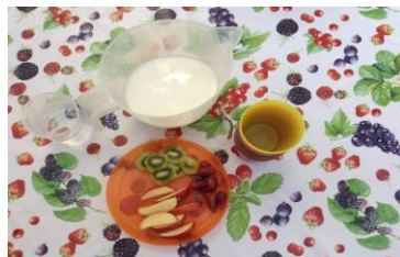
At snack time I will have a drink of milk or water and enjoy a selection of fruit.