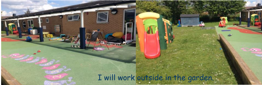
I will work outside in the garden.