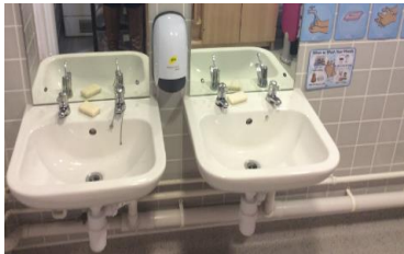
I wash my hands at the sinks.