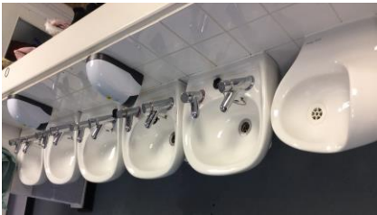
This is where I will go to the toilet.