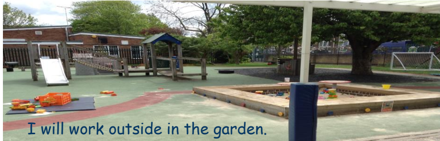
I will work outside in the garden.