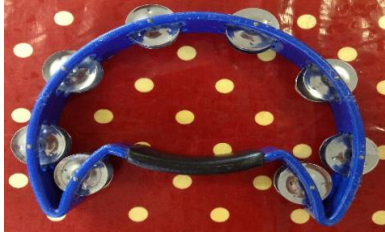
When it is tidy up time, I will hear the tambourine.