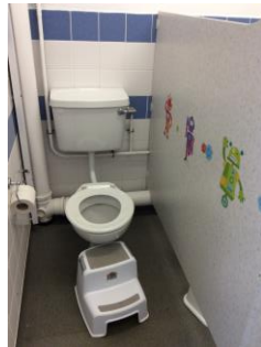
This is where I will go to the toilet.