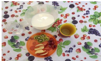
At snack time I will have a drink of milk or water and enjoy a selection of fruit.