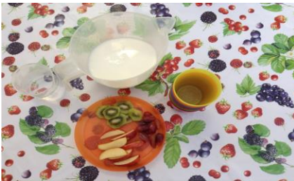
At snack time I will have a drink of milk or water and enjoy a selection of fruit.