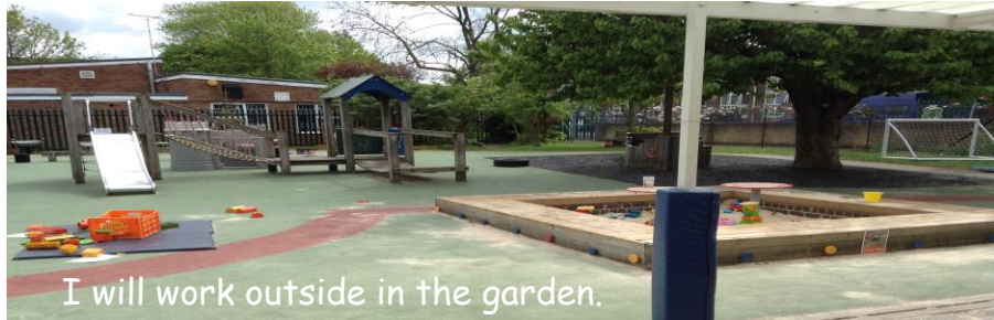
I will work outside in the garden.